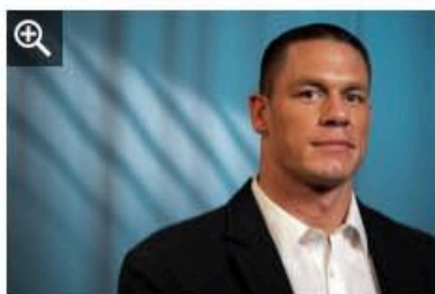
Professional wrestler and actor John Cena