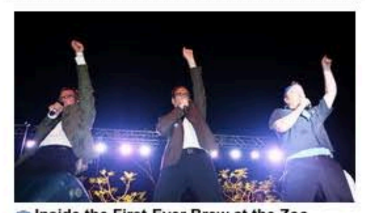
Inside the First-Ever Brew at the Zoo