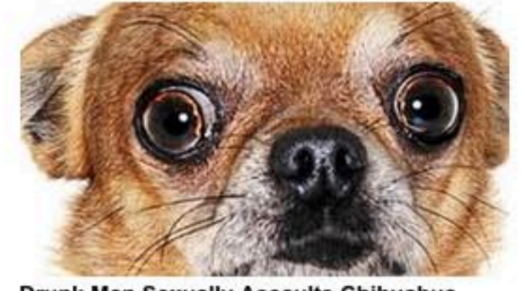
Drunk Man Sexually Assaults Chihuahua